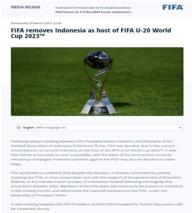
Figure 3. FIFA Statement Officially Canceling the U-20 World Cup in Indonesia

The turmoil intensified over the rejection that occurred until FIFA also highlighted the uproar. The complaint was fatal because FIFA stated on its official website that Indonesia's U-20 World Cup event was officially canceled. Although Erick Thohir, as Chairman of PSSI, has taken various ways, even President Jokowi also intervened; the hopes of the Indonesian people must be dashed by not qualifying Indonesia as the host of the U-20 World Cup in 2023.