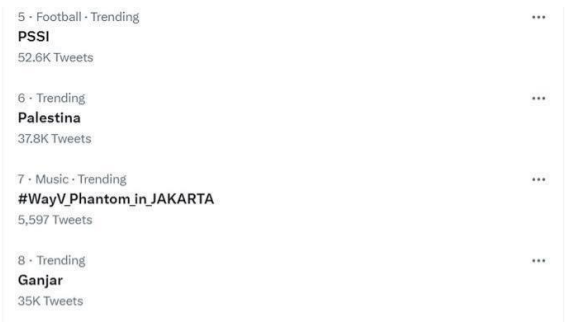
Figure 4. Ganjar Trending on Twitter

Through the official website, in its statement, FIFA did not reveal the exact reason for the cancellation of Indonesia hosting the U-20 World Cup. In its statement, FIFA only said Indonesia failed related to the current situation. The disappointment of the people of Indonesia also surfaced; they expressed their emotions by tweeting on Ganjar Pranowo's Twitter and Instagram comments column.