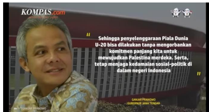
Figure 2. Ganjar’s Statement of Rejection of Israel’s National Team Participation

Several political Images, regional leaders, political parties and community organizations issued various statements rejecting the participation of the Israeli national team in the U-20 World Cup. One of the regional leaders who also rejected the Israeli national team was Ganjar Pranowo, Governor of Central Java. "So that the U20 World Cup can be held without sacrificing our long commitment to realize an independent Palestine. As well as maintaining socio-political peace within Indonesia," said Ganjar Pranowo in a written quote on YouTube Kompas.com.